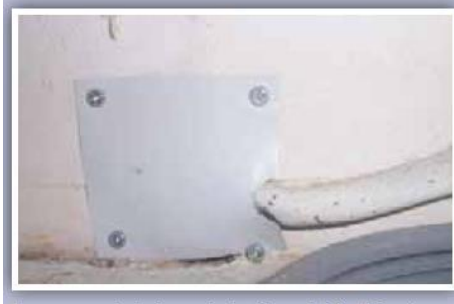
Power supply hole sealed with metal flashing.*

hole and wait 36 to 48 hours. If no tracks are evident for 3 consecutive nights, no animals are likely present. You may wish to make a temporary one-way exit using ¼-inch grid screening. Form the screening into a cone or funnel shape that will permit animals to leave but not to reenter. The large end should be sized to encircle the entry hole and be attached over the hole to the facade of the deck or building with nails or fence post staples. The small end should face away from the house and be 4 to 6 inches in diameter.