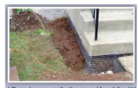
L-Shaped screen application around foundation.*

nails or fence post staples. Before completing final seal on the last entry point, make sure no animals are trapped inside. On the night before completing repairs, sprinkle flour in the entrance hole and check for tracks the following morning. You can also place one to two rags soaked in ammonia in the entrance