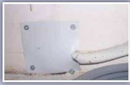
Power supply hole sealed with metal flashing.

mother skunk will start to move her babies as soon as night falls. It may take her more than one night to move all her babies. You will want to check the den to make sure all the babies have been moved and then fill in the hole with dirt and close up the access points by burying wood, rock, or a wire mesh into the area. You will want to bury your blockade by at least six inches to make sure the skunks cannot dig their way back in.