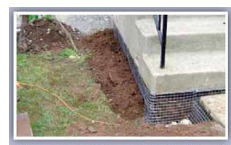
L-Shaped screen application around foundation.*